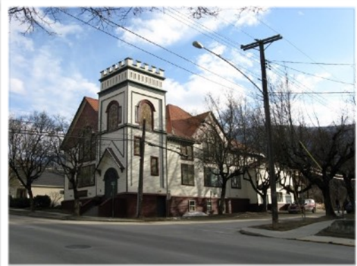
Nelson Covenant Church, Nelson B.C.

Prayer requests from Nelson Covenant Church: